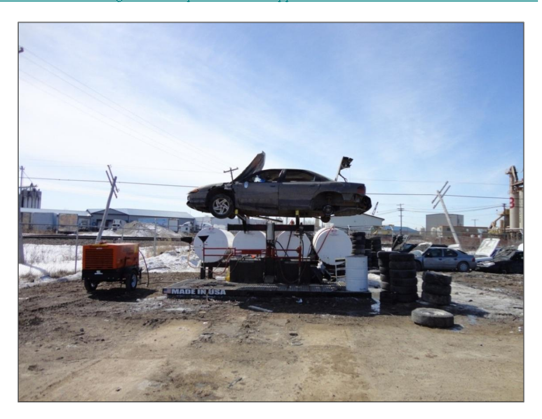
Figure 3: SEDA drain tower (fluid extraction system) located near the west perimeter of the site. Waste fluids are stored in the double-walled tanks behind the system.