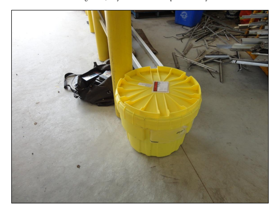
Figure 2: Battery spill kit accessible on site.